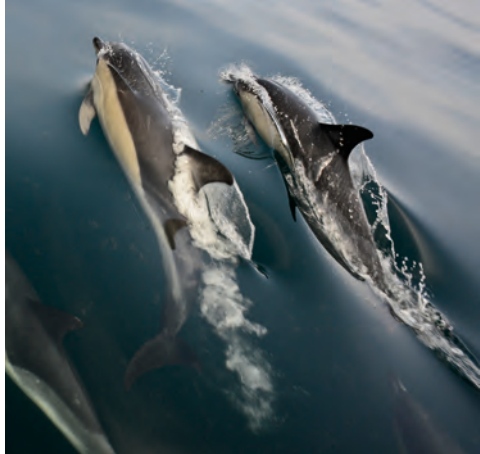
Common Dolphins by the Mewstone