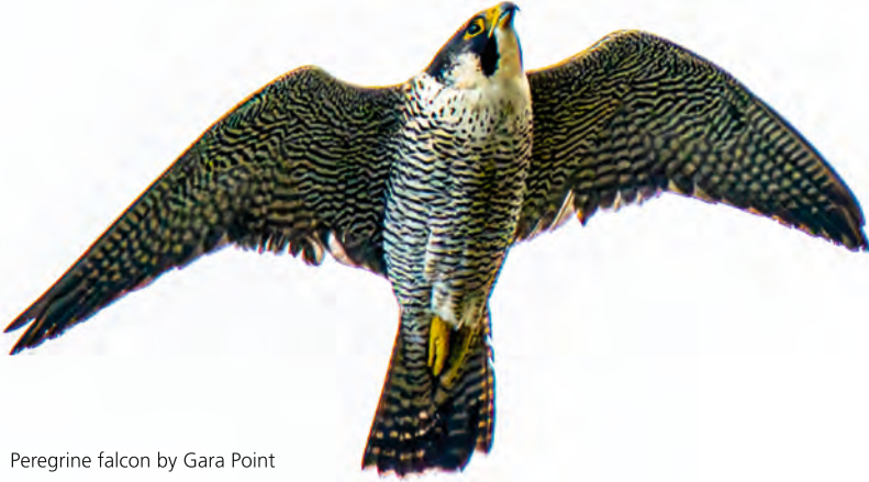
Peregrine falcon by Gara Point

The River Yealm estuary and surrounding seas are an important haven for a wide range of wildlife. The area offers great opportunities for wildlife watchers, but it is essential that you consider the well-being of the animals and avoid any unnecessary disturbance.