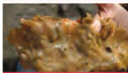
CARPET SEA SQUIRT