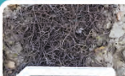
WORM WART WEED