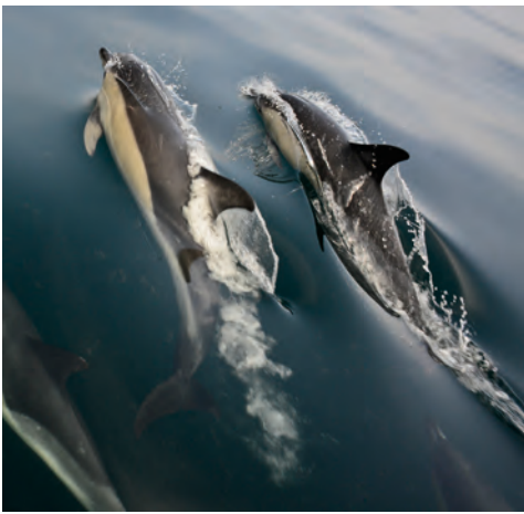
Common Dolphins by the Mewstone