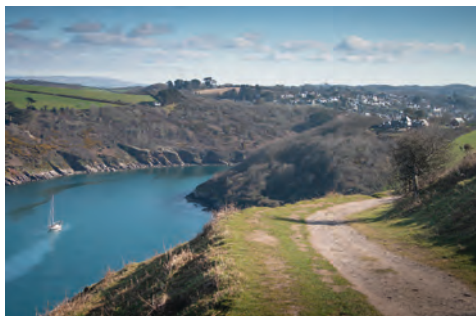
The Headland walk

Land at Kilpatrick steps or Wide Slip, adjacent to the visitor's pontoon in the Pool. Turn right at the top and take the lower path past Ferry Cottage (note the toll board) and follow the path through Passage Wood. The path climbs and joins a track where you turn right. Continue to climb and pass Battery Cottage and then around Cellar Bay at high level. Continue past the Coastguard cottages and through Brakehill Plantation (bluebells and rhododendron) to Mouthstone Point. Carry on around the headland past Gara Point and then on to Warren Cottage. After a further 600m keep left