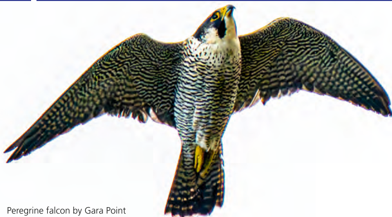
Peregrine falcon by Gara Point

The River Yealm estuary and surrounding seas are an important haven for a wide range of wildlife. The area offers great opportunities for wildlife watchers, but it is essential that you consider the well-being of the animals and avoid any unnecessary disturbance.